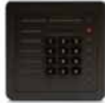
ProxPro® with Keypad